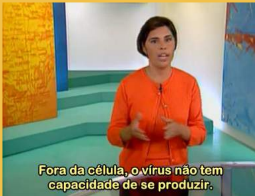
Fora da célula, o vírus não tem capacidade de se produzir.