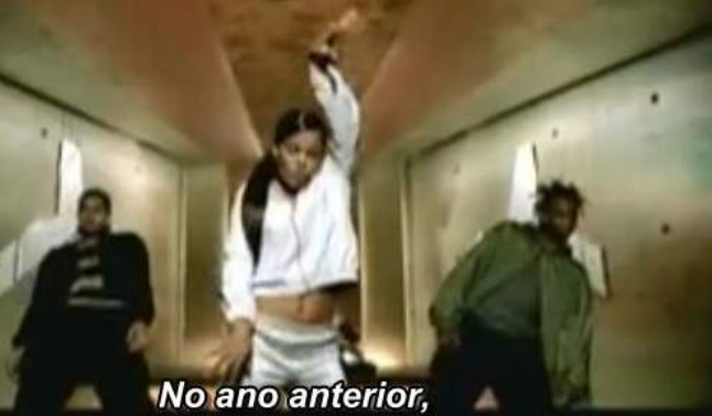
No ano anterior, ela só era conhecida...